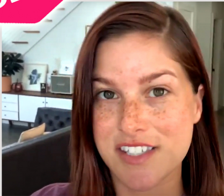
CASADEE POPE COUNTING ON THE WEATHER

This week CMT brings us the perfect visual concept: that the simple things can be the best. From television to Superstar, Cassadee Pope - in a "less is much more" production - spells it out that all we need is time and each other.